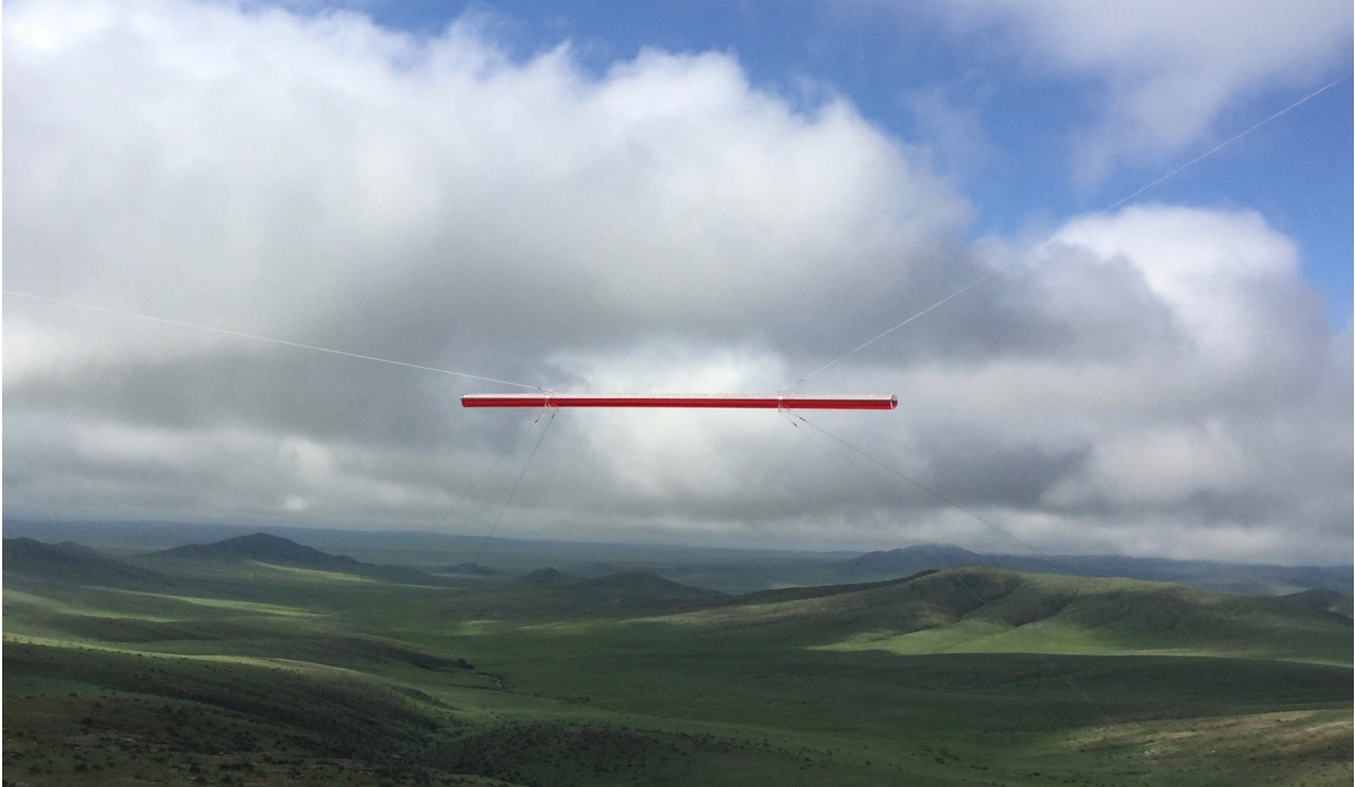
Land Scale 1: Levelling Water in Mongolia , red color water in acrylic tube suspended by wire to mountain tops

Curated by Lewis Biggs and Solongo Tsekuu