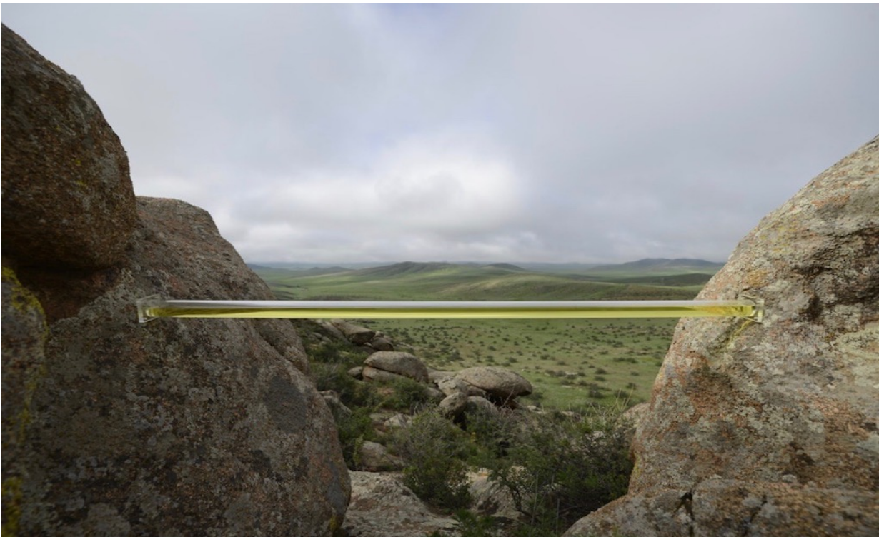
'Land Scale 2' Leveling Water in Murun Sum, Mongolia', Water, yellow color dye, clear acrylic pipe